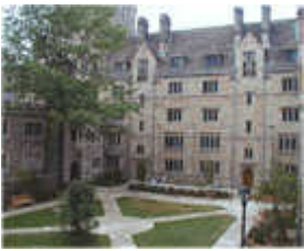
Branford and Saybrook Colleges Renovations, Yale University, New Haven, Connecticut Perry Dean Rogers and Partners Architects, Boston, MA