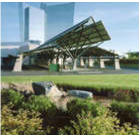
Mohegan Sun Project, 'Sunburst', Uncasville, Connecticut Kohn Pedersen Fox Associates, PC, New York, NY