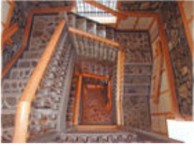
Gillette Castle Phase II Renovation, East Haddam, Connecticut Barkin Andrade Architects P.C., New Haven, CT