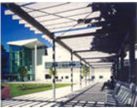
University of Connecticut, Stamford Branch, Stamford, Connecticut Perkins Eastman Architects, New York, NY