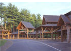
Hartford's Camp Courant, Farmington, Connecticut Du Bose Associates, Inc., Architects, Hartford, Connecticut