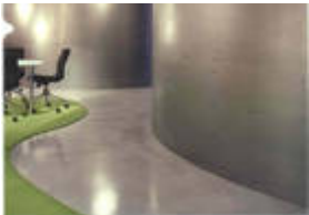
Offices for Asset Management Firm, Norwalk, Connecticut Beinfield Wagner Architects, South Norwalk, Connecticut