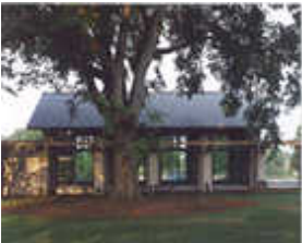
Admissions & Career Services Center, Trinity College, Hartford, Connecticut Bohlin Cywinski Jackson, Philadelphia, PA