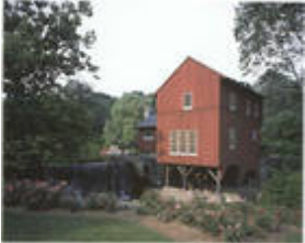
Sprain Brook Sawmill, Washington Depot, Connecticut Halper Owens Associates Architects, Washington, Connecticut