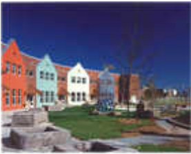
Montessori Magnet School, Hartford, Connecticut Smith Edwards Architects, Hartford, Connecticut