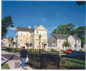
Monterey Place, Hope VI, New Haven, Connecticut Fletcher Thompson Inc., Shelton, Connecticut