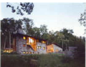
Caretaker's Complex, Washington, Connecticut Gray Organschi Architecture, New Haven, Connecticut