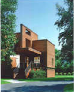
Pier Way Library, Westport, Connecticut Roger Ferris + Partners, Westport, Connecticut