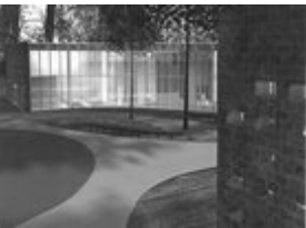
Elementary School # 11, Fairfield, Connecticut Skidmore, Owings & Merrill LLP, New York, NY