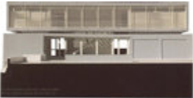
Prutting Residence, New Canaan, Connecticut Kaehler - Moore Architects, LLC, Greenwich, Connecticut