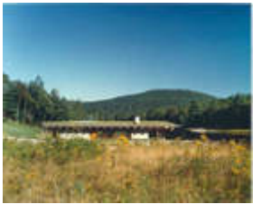
Tennis House, Washington, Connecticut Gray Organschi Architecture, New Haven, Connecticut