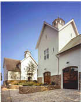
Residence at 1 & 2 Rocky Road Point, Bell Island, Connecticut Beinfield Wagner Architects, South Norwalk, CT