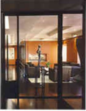
Stern Apartment, New York, NY Kaehler - Moore Architects, LLC, Greenwich, Connecticut