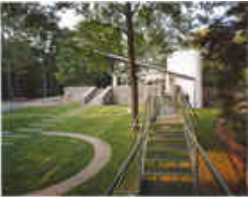
Keegan Playhouse, Greenwich, Connecticut Austin Patterson Disston Architects, Southport, Connecticut