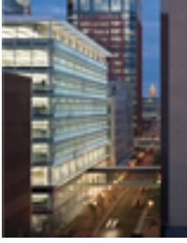
Wells Fargo Financial Building, Des Moines, IA Pickard Chilton, Architects, New Haven, CT