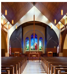
Pipe Organ Façade for West Side Presbyterian Church, Ridgewood, NJ Newman Architects, LLC, New Haven, CT