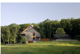
Mountain Road Residence, Kent, CT Halper Owens Architects LLC, Washington Depot, CT