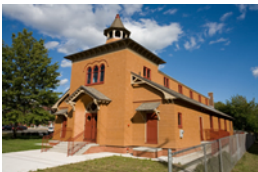
Recital Hall at Betsy Ross School, New Haven, CT Barkin Associates Architects, P.C./JCJ Architecture, Hartford, CT