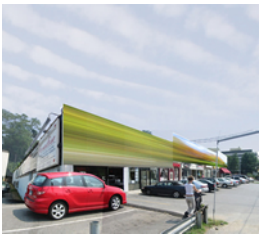
Studies for Strip Mall, Stamford, CT PelOverton LLC, New York city, NY