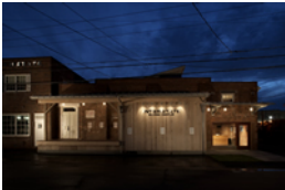
Interstate Design Center, Greenwich, CT Halper Owens Architects LLC, Greenwich, CT