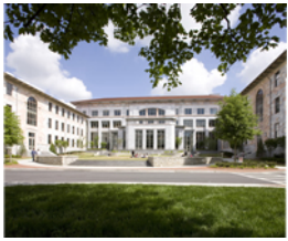
Emory School of Medicine, Medical Education Building, Atlanta, GA The S/L/A/M Collaborative, Glastonbury, CT