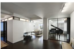
Central Park West Apartment, New York City, NY Joeb + Partners Architects, LLC, Greenwich, CT