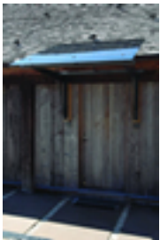
Hobby Barn Glass Canopies, Pound Ridge, NY Joeb + Partners Architects, LLC, Greenwich, CT