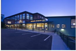
Integrated Day Charter School Gymnasium, Norwich, CT Point One Architects + Planners, Old Lyme, CT