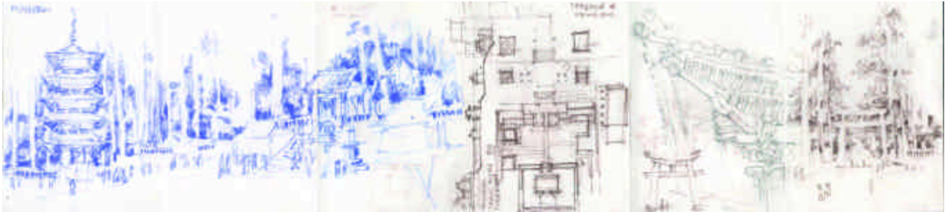
Crayon, Pen and Ink

Sketch Book of Japan, a Continuous Narrative Bimal Mendis, Cesar Pelli & Associates, New Haven